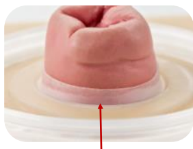
Close-up image of Flex & Form Collar

Patented collar gently clings and shapes around the stoma